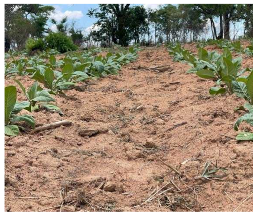
The land is still very dry and not much rain has happened in that area