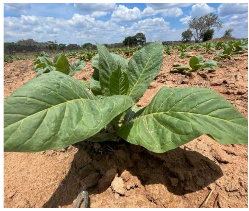
15/11/2021 The tobacco is completely free from any dusty surface and all insects.