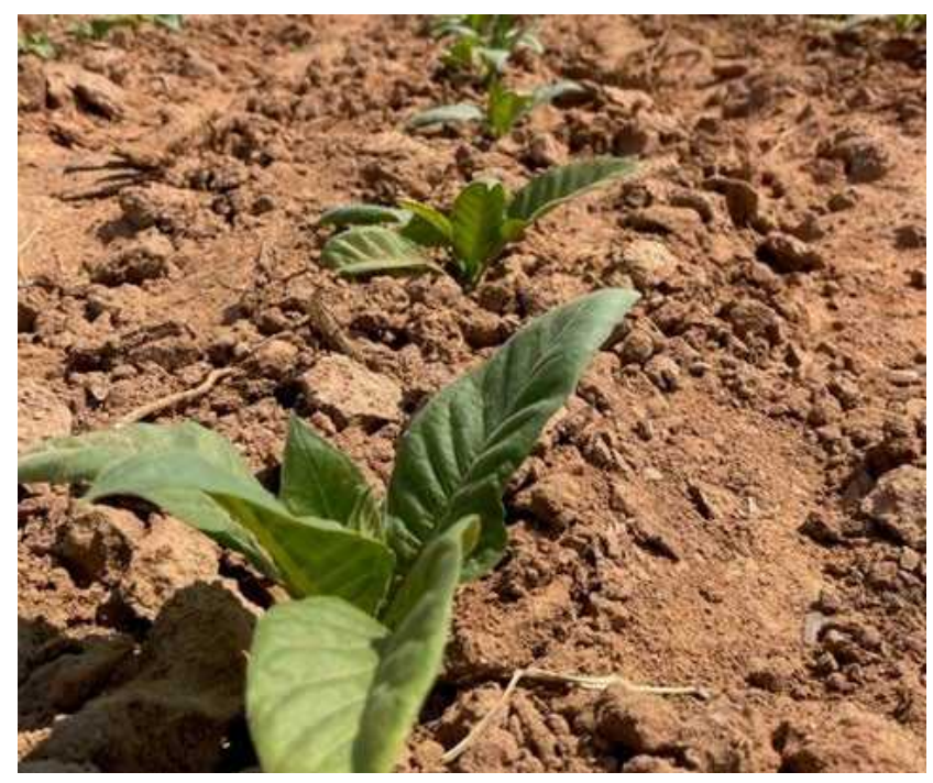
The trial area has received 4mm of rain this season, so the soil is still very dry, and the tobacco has not shot up yet.