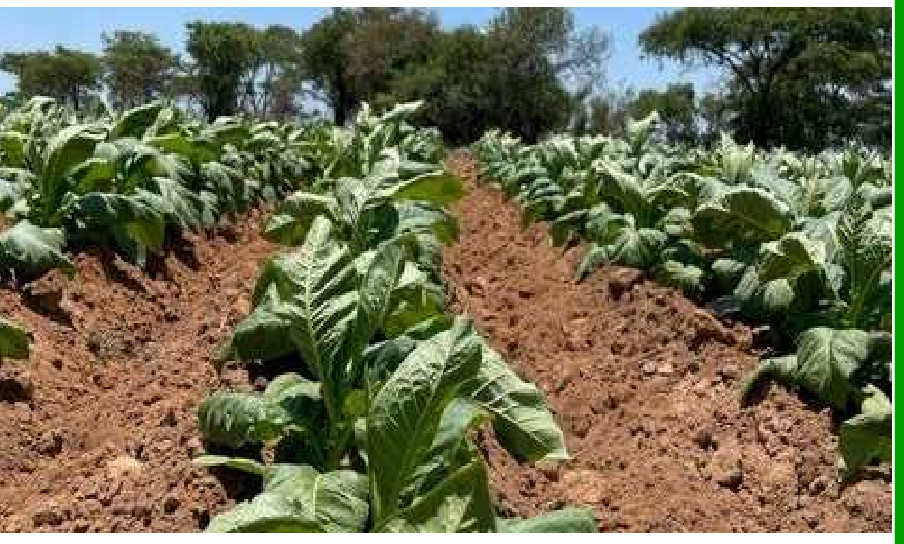
The trial area received a small amount of rainfall over the past week.